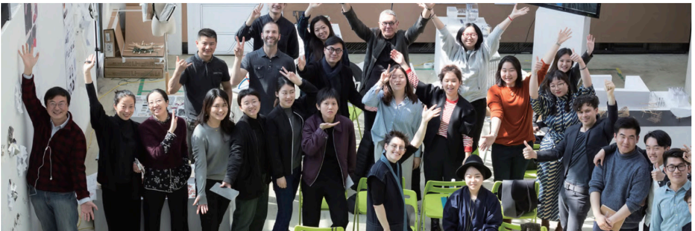
Tongji D&I-ArtCenter College of Design International Workshop

D&I takes “to learn and create, for a meaningful life and a better world” as its motto, with an initiative seeking to respond to the challenges the world faces today by cultivating leaders of smart and sustainable design and innovation who pursue academic excellence while contributing to social development. Our goal is to be pioneering, inclusive and diverse, to learn and to practice, in order to pursue excellence and continue to “make substantial contributions to human progress”.