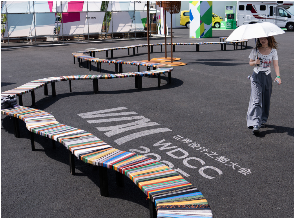
World Design Capital Conference (WDCC)