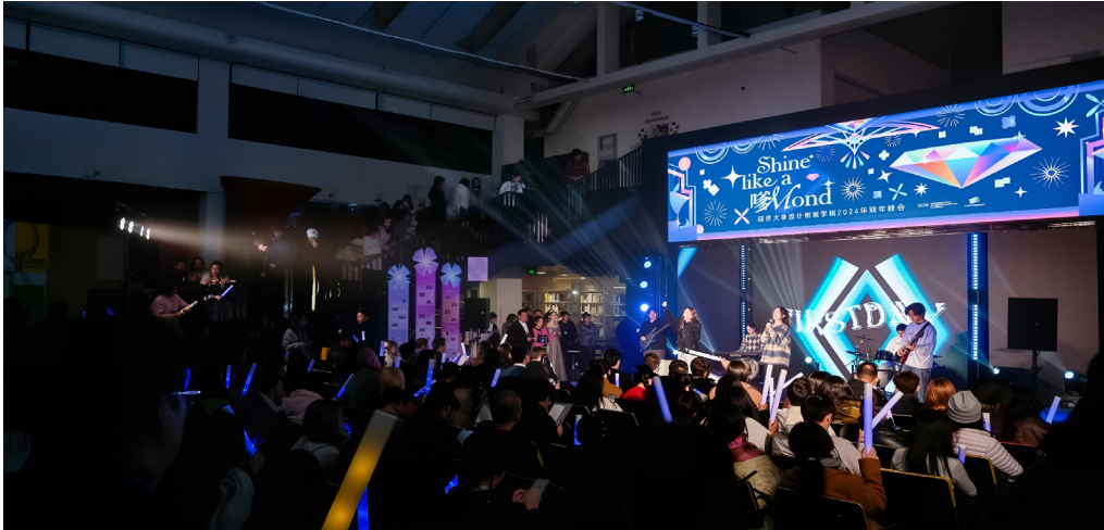
New Year Party